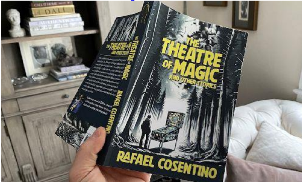
Hot Spring Books:

Science Formula is a Proven Weight Loss Shake Ikaria Lean Science Formula