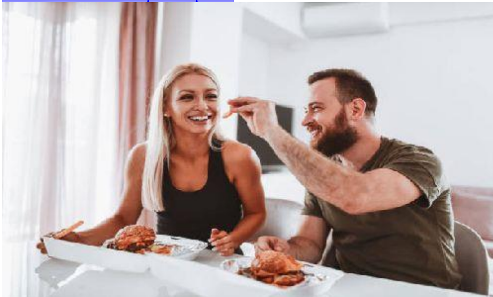
Slim Down & Feel

Young Again Without Expensive PrescriptionsAlpilean