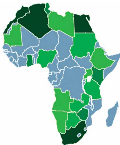
Fig. 1. Brachytherapy availability in Africa. Varying shades of green show the availability and density of brachytherapy units in countries where they are available. Blue color shows where there are no brachytherapy units

Cervical cancer incidence and total number of brachytherapy units vary significantly across the continent, with the former being significantly higher than the lat-