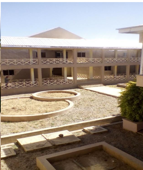
Plate xx: Sidewalk ways as hardscape element at Jos University Teaching Hospital,(JUTH)