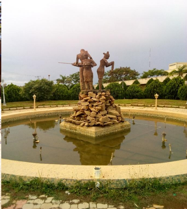
Plate xvii: Cobbles used as the base of water fountain which serves as focal points at the art gallery of Jos Zoo and the Jos University Teaching Hospital (JUTH) permanent site.