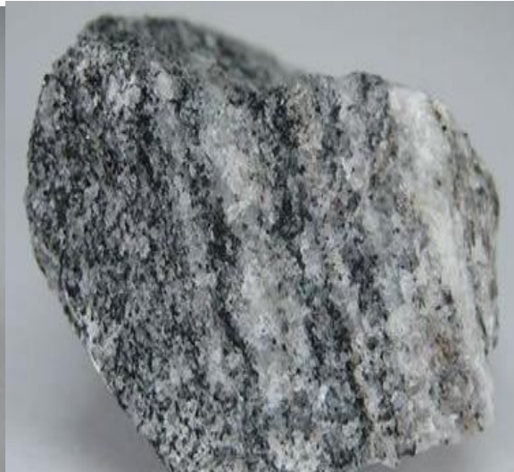
Plate xi: Gneiss is a foliated metamorphic rock that has a banded appearance and is made up of granular mineral grains. It typically contains abundant Quartz or feldspar minerals.