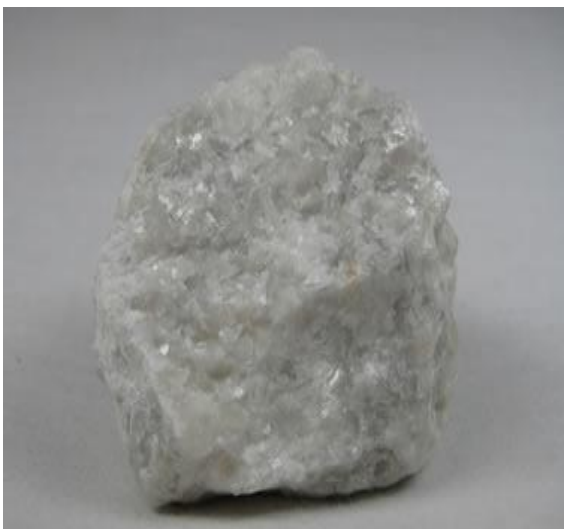
Plate x: Marble is a non-foliated metamorphic produced by metamorphism of limestone It is composed of calcium carbonate.

Source: Archives of National Metallurgical Development Centre (NMDC) Jos, 2018.