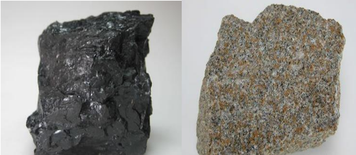
Plate v: Coal an organic sedimentary rock Formed from plant debris

There are three basic types of sedimentary rocks which namely Clastic sedimentary rocks such as breccia, conglomerate, sandstone (See Plate vi), siltstone, and shale are formed from mechanical weathering debris; Chemical sedimentary rocks , such as rock salt, iron ore (See Plate vii), chert, flint, some dolomites , and some limestone , form when dissolved materials precipitate from solution and Organic sedimentary rocks such as coal (See Plate v), some dolomites, and some limestone, form from the accumulation of plant or animal debris (Balsubramanian, 2017).