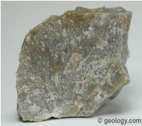
Plate viii: Quartzite is a non-foliated metamorphic rock produced by metamorphism of sandstone