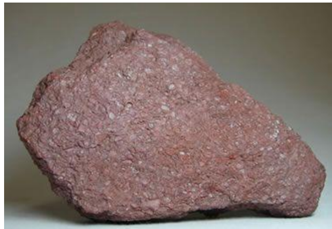
Plate vii: Iron Ore is a chemical sedimentary rock that forms when iron and oxygen (and sometimes other substances) combine in solution and deposit as a sediment.