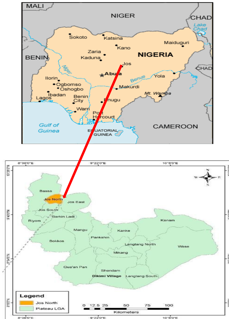
Figure 2: Map of Nigeria (top) showing Jos and Map of Plateau State (down) showing Study area.