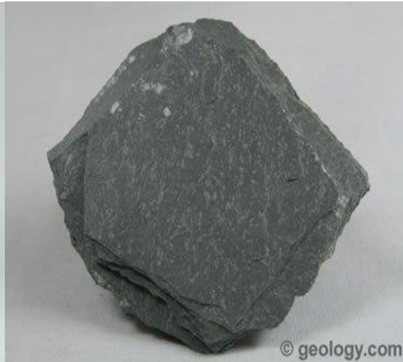
Plate ix: Slate is a foliated metamorphic rock produce through metamorphism of shale