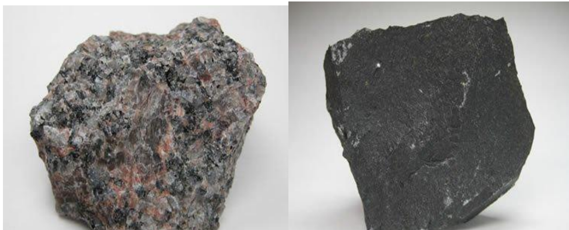
Plate i: Granite is a coarse-grained, light-colored Intrusive igneous rock