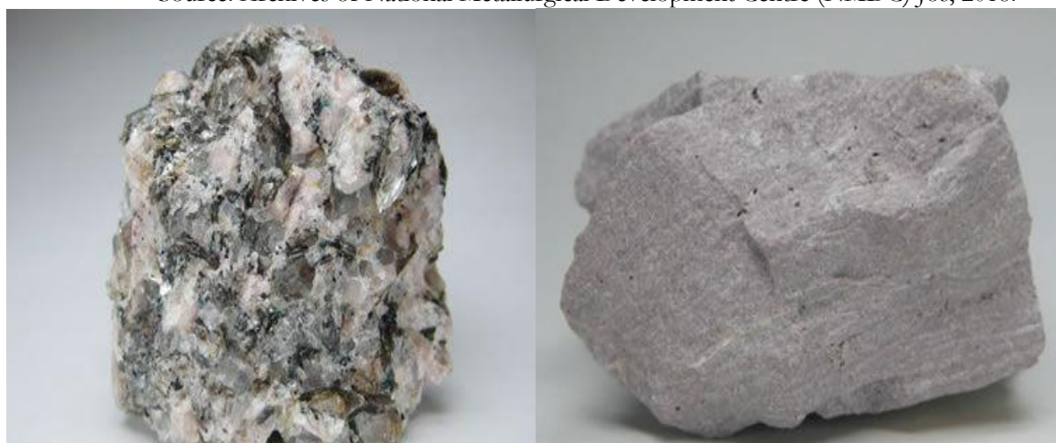
Plate iii: Pegmatite is a light-colored, extremely Coarse-grained intrusive igneous rock.