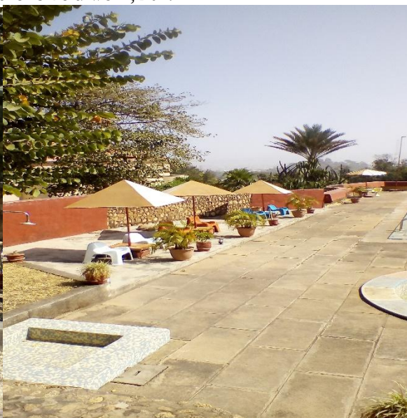
Plate xiv: Cut flagstone made from limestone used for pool decks, patios, wall caps and garden walkways