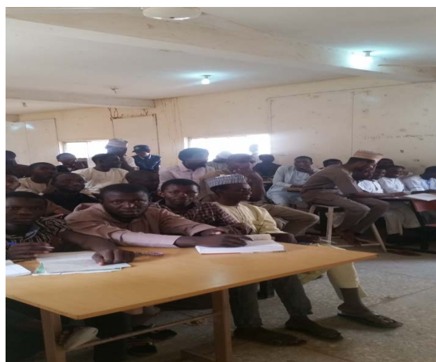
Plate I. Congested Nature of 100 Level Studio during the Lecture Time

The research findings show that: “inadequate facilities in the studios such as the drawing boards have led to the impossibility of all the students working in the studios at the same time when there are no lectures, and these have negatively affected the avenue for the students to learn from each other in the studios; inadequate drawing boards in the studios have also led to the congestion in the studios as more than one students are attached to a drawing board during lectures. These are in line with the result of the study made by [19] that showed that many schools find their classroom environments inadequate to address certain teaching and learning conditions due to space limitation, storage issues or the classroom lacking specificity to programme. The findings further showed that the number of the students that are not satisfied with the spaces in studios in relations to their population are significantly rated high due to congestions”. The research conducted by [14] on the determination of the state of architecture studios in the university in Nigeria further revealed that: “Plate I shows the congested nature of 100 level studio during the lecture time.