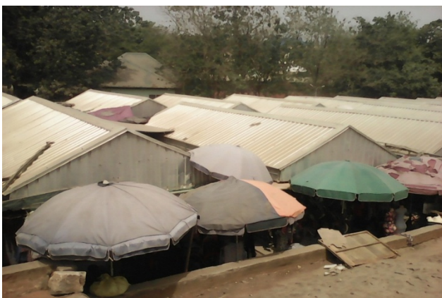
Plate IV. Closeness of the Roofs in the Eastern Part of the Informal Section of Garki Model Market

It was noticed that all the roofs of buildings in the whole Garki model market were absolutely not designed against fires. The distance that exists in between buildings or between the boundary and building is obviously a crucial factor to consider as it is the severity of fire outbreaks that are ascertained via the fire loads of