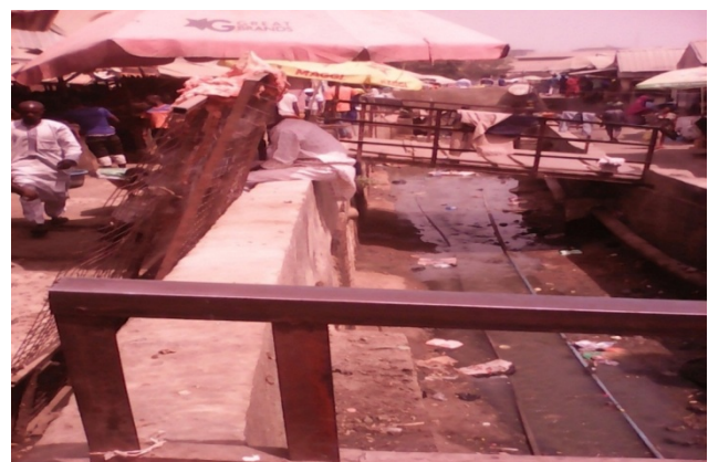
Plate I. Canal In-between the Formal and Informal Sections of Garki Model Market

Buildings should be approachable for the firefighting vehicles in case of fire outbreaks [14,15]. However, a canal of three metres wide was constructed in Garki model market and it divided the market into formal (lock-up shops) and informal (open stalls) sections. There are no bridges that can allow the firefighting vehicles to move from the formal section to the informal section to fight fire in case of fire outbreak. Apart from the gates at the formal section, there is no any other gate to lead people or firefighting vehicles to the informal section of the market. Plate I shows a canal in Garki model market. In addition, the discussion with the staff of the managing company of Garki model market showed that there is no first aid centre in the market where people that may become victims of the fire outbreaks can receive immediate medical treatments before they can be transferred to the hospital.