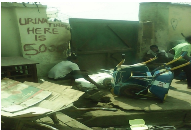
Plate II. Pedestrian Exit Gate in the Formal Section of Garki Model Market

pedestrian and vehicular exits which is 4.5 metres wide in the formal section of the market; this is wide enough to allow many people to pass through it at the same time when there are fire outbreaks. The second exit gate is locked up with a pad lock and it is only for pedestrian exits which is two metres wide in the formal section of the market; this is not wide enough to allow many people to pass through it at the same time when there are fire outbreaks. Contrary to this immediate statement, the minimum overall width of the gate opening shall be 6.0 metres for fire safety purpose [16]. Similarly, the exit gates shall have a clear opening of not less than 7.2 metres for a dual traffic direction [17]. Thus, the design of Garki model market is considered unsatisfactory with respect to the fire exit gates in relation to the size of the market in terms of the numbers of facilities (1,430 sales points). Plate II shows a pedestrian exit gate in Garki model market.