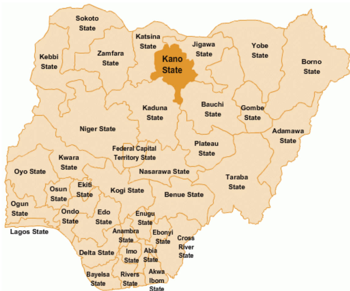
Figure 1. Nigeria showing Kano State as highlighted; its other 35 States and the Federal Capital Territory, Abuja.

the area of this study is a city in the northern part of Nigeria and the capital of Kano State; it is the second largest city in Nigeria after Lagos in Lagos State, with over four million citizens living within 449 kilometre square of land located in the Savanna, south of the Sahel and it is a major route of the trans-Saharan trade. The city has been a trade and human settlement for millennia. (Figure 1) shows Nigeria revealing Kano State as highlighted; its other 35 states and the Federal Capital Territory, Abuja.