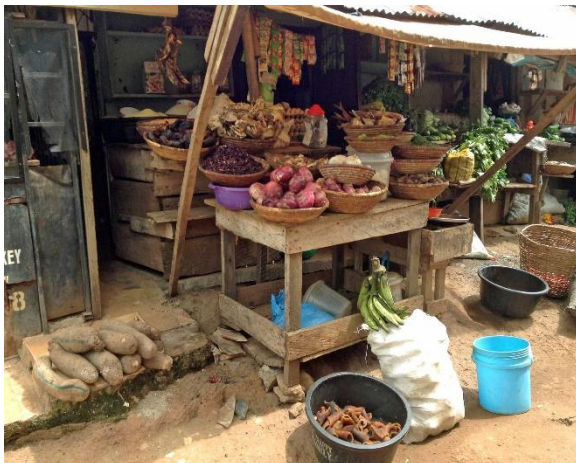
Figure 4. Galadima Market showing Zinc Roofing Sheets and Canopy Roof Covering.

Likewise, the use of zinc roofing sheets were found in Galadima market; this type of roofing sheet is not resistant to fire. From the information obtained from Huntington Beach Fire Department (2010), [7] Mitsopoulos and Dimitrakopoulos (2007); [8] Recalls and Safety Alerts (2019), [17] canopies are not resistant to fire. However, the use of canopy roof covering was observed in this market. (Figure 4) shows the used of zinc roofing sheets and canopy roof covering in Galadima market.