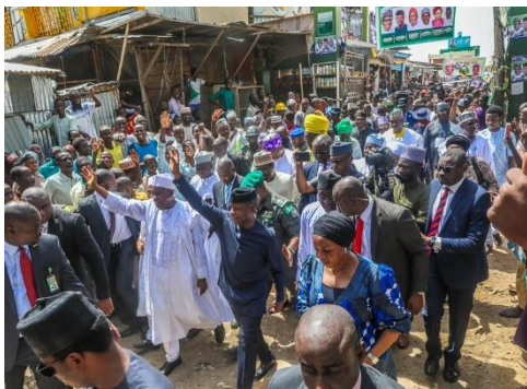
Figure 2. Abubakar Rimi Market showing Zinc Roofing Sheets and None-fire Resistant Wooden Structural Members of Roof.

Examples of roofing sheet that have high fire resistance are: clay roof tiles, concrete roof tiles and profiled metal sheet (Fire Centre, 2017; [4] Fricklas, 2015; [5] Neufert and Neufert 2000) [11]. However, the use of zinc roofing sheets were found in Abubakar Rimi (Sabon gari) market; this type of roofing sheet is not resistant to fire. According to Building and Construction Authority (2017); [2] Neufert and Neufert (2000) [11] and Quarles (2013), [16] materials for designing buildings against fire outbreaks should be able to resist surface flame spread. However, there is no fire resistivity with regards to the use of wooden structural members of roofs in the market. (Figure 2) shows the use of zinc roofing sheets and none-fire resistant wooden structural members of roof in Abubakar Rimi market.