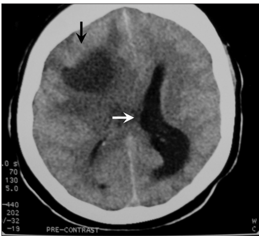
Figure 1: Unenhanced axial computed tomography image showing a hyperdense, broad-based lesion in the right frontal region (black arrow) with effacement of the ipsilateral lateral ventricle and with significant mass effect (white arrow)

The patient made good recovery, evident by the return of rational verbal communication and muscle power to the left half of the body. The patient is being followed up.