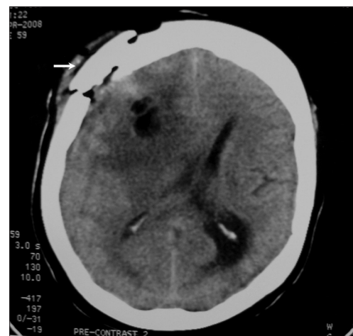
Figure 4: Postsurgical (total tumor excision) noncontrast axial cranial computed tomography imaging showing significant tumor removal but with residual mass effect. White arrow showing craniotomy site