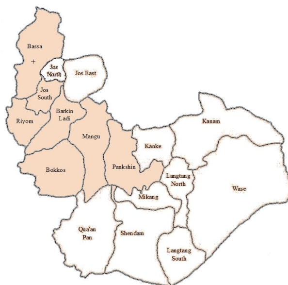
Figure1: Map of Plateau State showing Acha Growing Region (Shaded)

Acha (Digitaria Specie) is a cereal crop whose production is predominantly in Plateau State of Nigeria, being world’s highest producer. Figure 1 is the map of Nigeria showing acha producing region. This region includes Jos South (on latitude 9° 48’ 00” North and longitude 8° 52’ 00” East), Bokkos (on latitude 9° 18’ 00” North and longitude 9° 00’ 00” East), Barkin Ladi (on latitude 9° 32’ 00” North and longitude 8° 54’ 00” East), Mangu (on latitude 9° 31’ 00” North and longitude 9° 06’ 00” East), Pankshin (on latitude 9° 20’ 00” North and longitude 9° 27’ 0” East), Bassa (on latitude 9° 56’ 00” North and longitude 8° 44’ 00” East) and Riyom (on latitude 9° 38’ 00” North and longitude 8° 46’ 00” East).