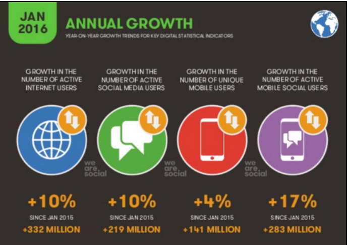
Figure 2: Sourced from Statista (2016)

The data in Figures 1 and 2 show the most recent development in internet usage worldwide. It unveils a world of opportunity for any country genuinely willing to walk its talk as far as tourism promotion is concern. In Asia-Pacific alone, from January 2015 to January 2016, there has been +12% (+199 Million) growth in the number of active internet, number of active social media users grew by +14% (145.8 Million) while there was a recorded increase of 4% (+155.6 Million) in the number of mobile connections and +21% (+187.3 Million) growth in the number of active mobile social users. Asia-Pacific performed above the global average in all areas except for number of mobile users. The India’s Ministry of Tourism can leverage on this.