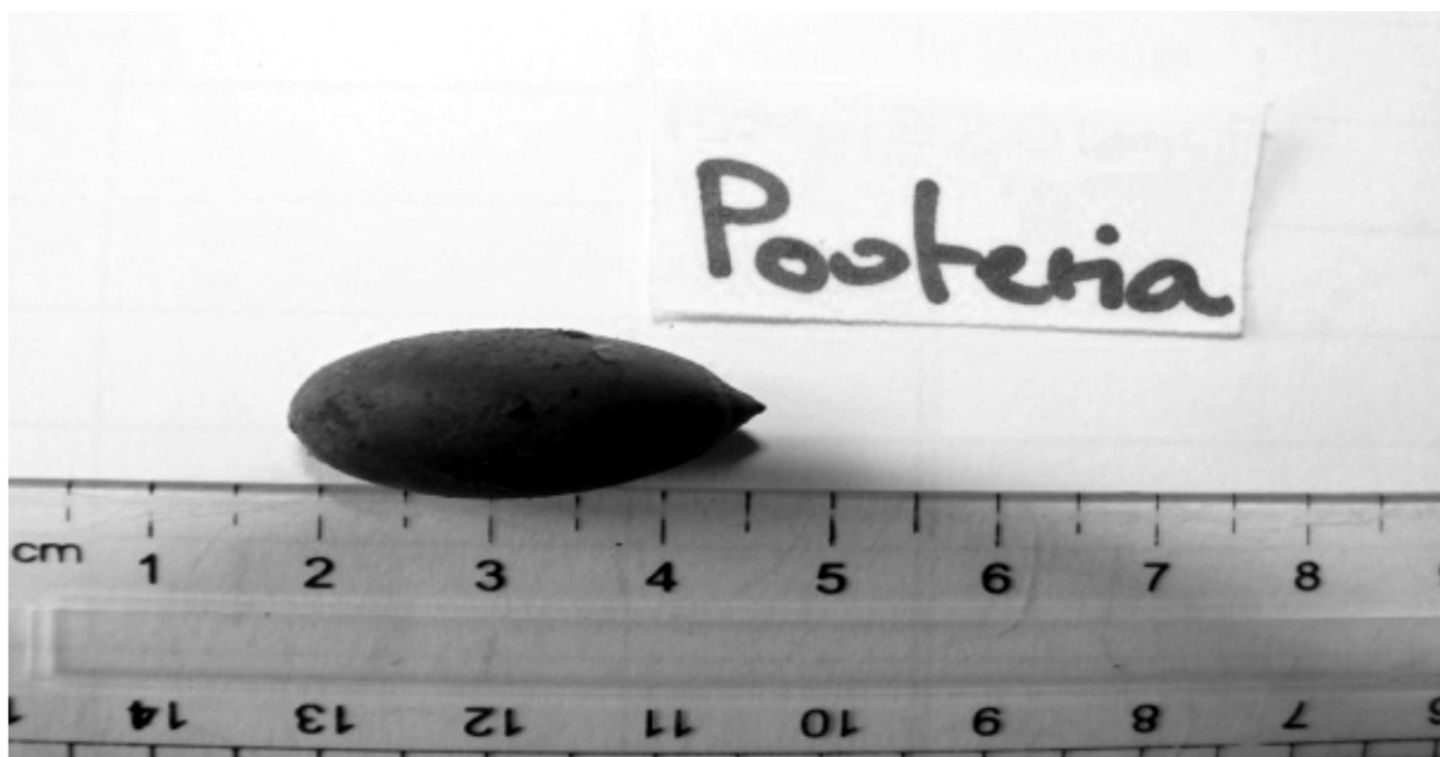
Figure 2: Seed of Pouteria altissima

Guild of Frugivores on three Fruit-Producing Tree Species ( Polyscias fulva , Syzygium guineensis subsp. bamensdae and Pouteria altissima ) in Ngel Nyaki Forest Reserve, a Montane Forest Ecosystem in Nigeria.