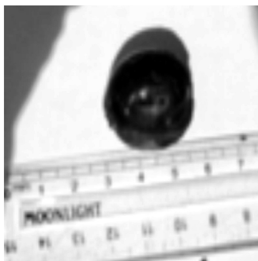
Figure 3: Seed of Syzygium guineensis subsp. Bamensdae

Syzygium guineensis (Willd). subsp. bamensdae F. White ( Myrtaceae ) is a medium-sized evergreen tree 10- 20 m high associated with Nigerian/Cameroon montane and riparian forest above approximately 1500m. The ripe fruit is a purple drupe and measures 20mm in diameter and 30mm in length (Fig 3) (Keay 1964). Within the study area it is found mostly on forest edge and in the fragments.