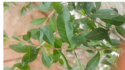
Plate 2. Lawsonia inermis