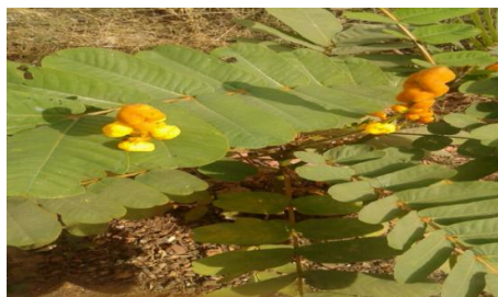
Plate 1. Senna alata